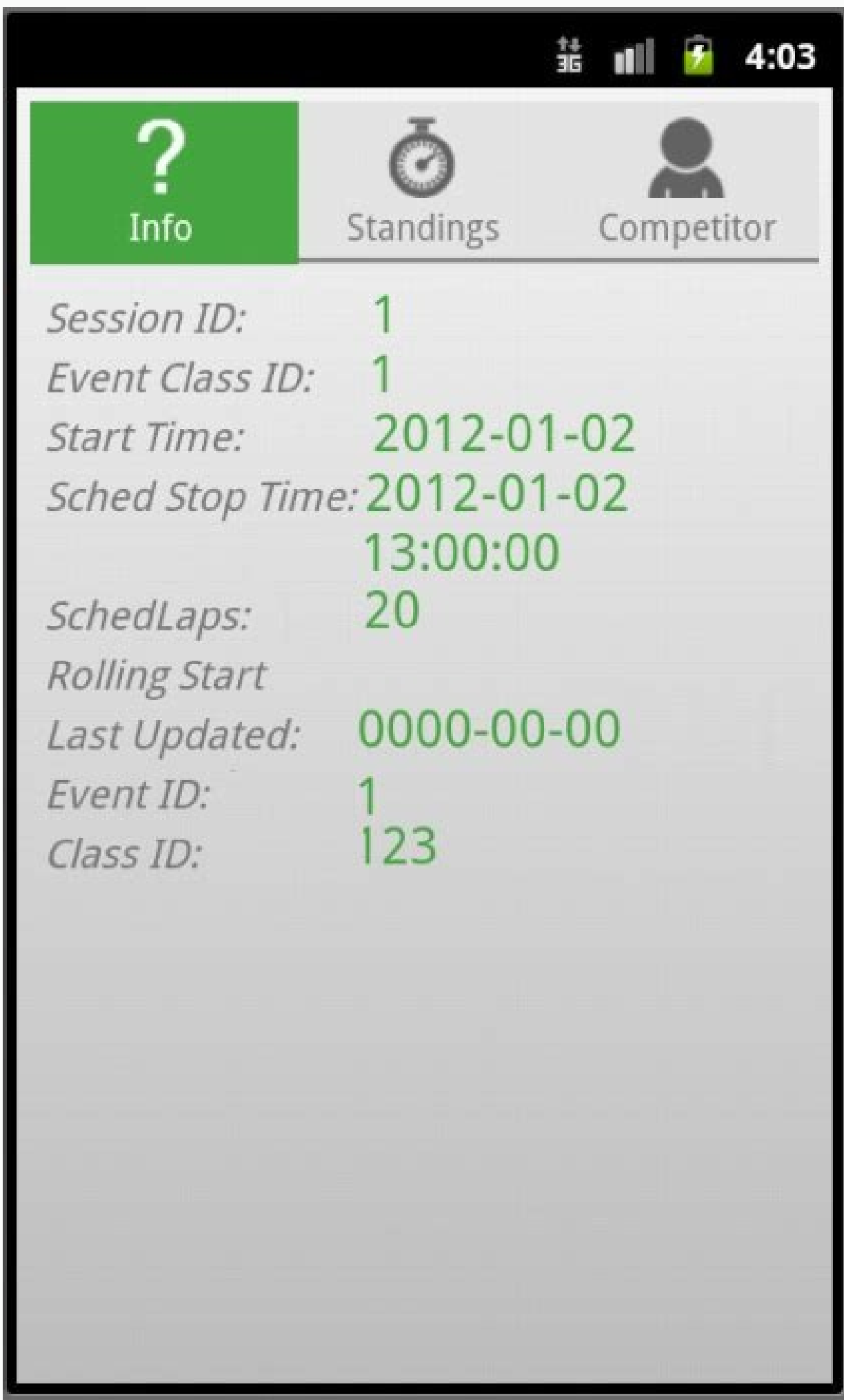
Android textview set text alignment programmatically.