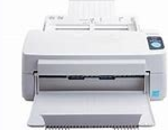
Panasonic kv-s1025c driver: Panasonic kv-s1025c driver windows 7. Panasonic kv s1025c isis drivers. Driver scanner panasonic kv-s1025c. Descargar driver panasonic kv-s1025c.