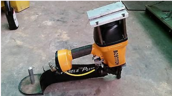
Bostitch n89c-1 manual.